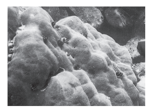
Fig. 2. Representative sample of low infestation of polychaetes on porite coral from a transect of 50m

Andaman reefs are rich in their biodiversity and abundance as revealed in our surveys (Dam Roy et al., 2007). There are reports world-wide regarding the polychaete infection on corals due to enhanced anthropogenic activities in reef areas (Wielgus et al., 2006). The study sites Aberdeen jetty, North Bay and Havelock jetty are regularly visited by tourists. Other sites Hathi Dera, North Wandoor and Chidiyatapu are having lesser anthropogenic pressure as they are away from main stream tourism areas. Havelock jetty is having only degraded corals with the reefs affected during jetty construction. Usually the number of polychaetes in a transect of 50 meters is 100-200 (Fig. 2), but in places of infection, the number goes up to 80-120 number per meter (Fig. 3). This high number of polychaetes seems to affect the health of corals