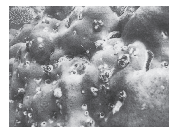
Fig. 3. Representative sample of high infestation of polychaetes on porite coral from 1m transect in North Bay

The polychaetes infecting the porites are Spirobranchus giganteus (Grube 1862), S. spinosus and Sabella sp. The polychaete infection leads to bleaching of corals in a small area which looks similar to infection by fungal diseases. The increased presence of polychaetes leaves the corals